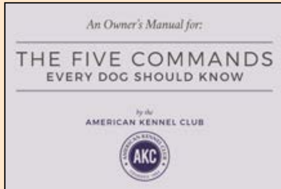
THE FIVE COMMANDS EVERY DOG SHOULD KNOW

We hope this information was valuable to you in helping your puppy live a long, healthy, happy life. Below, find additional books in our Owner's Manual series designed to strengthen the bond between you and your furry family member.