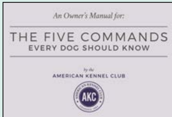
THE FIVE COMMANDS EVERY DOG SHOULD KNOW

We hope this information was valuable to you in helping your puppy live a long, healthy, happy life. Below, find additional books in our Owner's Manual series designed to strengthen the bond between you and your furry family member.